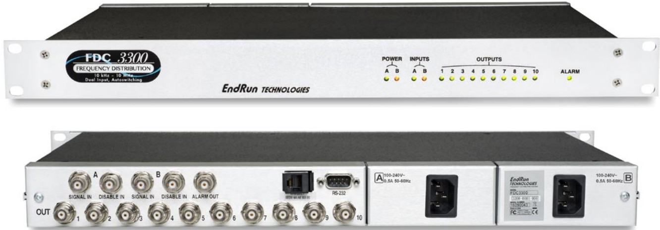
FDC3300 front and rear panel views. Shown with optional dual power supplies and Ethernet interface.