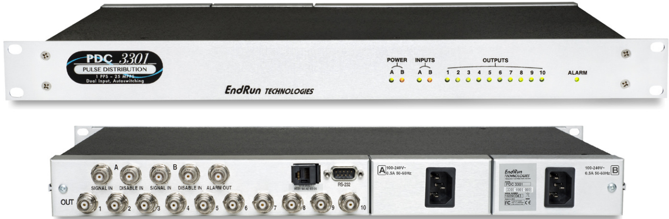
PDC3301 front and rear panel views. Shown with optional dual power supplies and Ethernet interface.