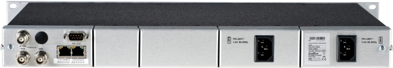
Sonoma rear panel with optional dual power supplies. Antenna input TNC connector on upper left. Two spare BNC connectors on lower left. One RS-232 connector. Two 10/100/1000 Base-T Ethernet ports. Optional dual power supply connectors on right.