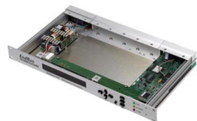
A clean and reliable solid-state design.